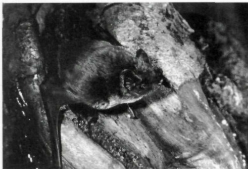
Fig. 1. og 2. Leisler's bat , Nyctalus leisleri .