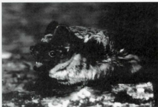
Fig. 5. og 6.