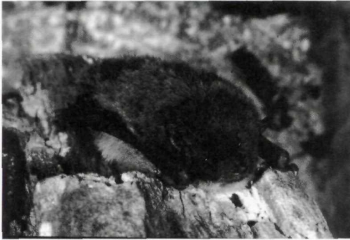
Fig. 3. og 4.

Nathusius's pipistrelle , Pipistrellus nathusii .