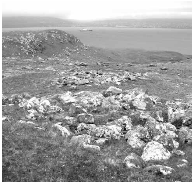
Figure 8. Archaeological structures no. 3 (foreground) and 2 (background).

Structures 1 and 4 reach a maximum height of about 1 m and 1.5 m respectively, with five courses of stones where preservation is at its best (e.g. Fig. 7). In the case of the other structures, their outline is generally in the form of a single visible course (Fig 8). In all instances, wall tumble beyond the area delimited by the foundation stones is apparent. It is not possible