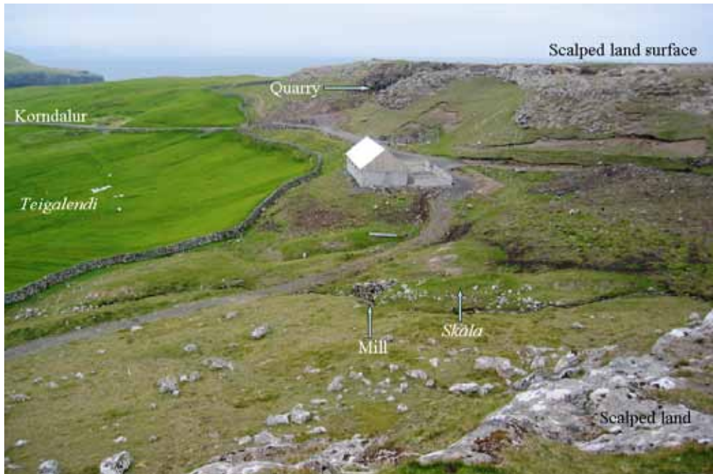
Figure 5. Features and places mentioned in the text from the area at the junction between the managed reinavelta area of teigalendi and the scalped land.