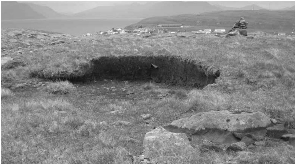
Figure 6. Remains of blanket peat (30 cm deep) on the scalped area. A wayside cairn is visible in the top right of the picture..