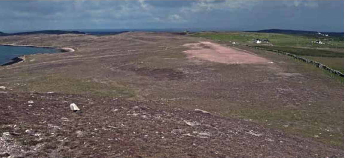
Figure 1. Scalped land on the island of Papa Stour, Shetland. The area over the greater part of the photograph has suffered the near-total removal of peat or turf down to the mineral soil surface or to bedrock (the brighter patch in the top centre right is the island's airstrip). The land in the top right of the picture is an area of improved soils and managed agricultural land.