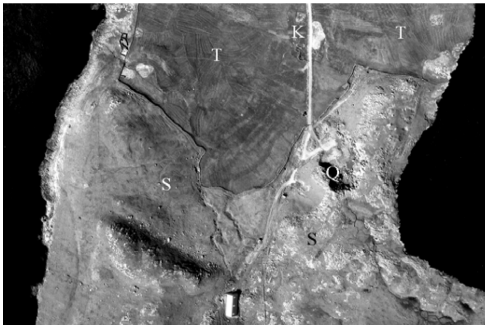
Figure 3. Aerial photograph taken in 1988 including the study area delimited in Figure 2. North is at the top of the picture. Key: K, Korndalur; Q, quarry; S, scalped areas; T, Teigalendi (area of reinavelta). Only the more southerly modern farm building was present at this time. (Photograph courtesy of Matrikulstovan, Tórshavn).