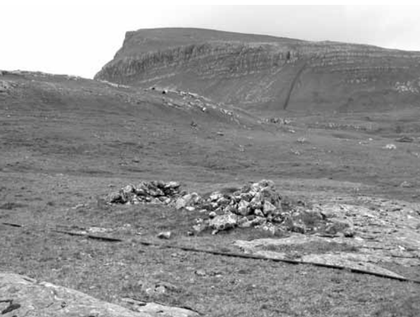
Figure 7. Archaeological structure no. 1.

tures are to be found on the stony surface of the scalped plateau. Those closest to the quarry (there may be others elsewhere) are described in Table 1 in terms of their approximate shape and size (maximum dimensions in plan); the structure numbers correspond with those in Figure 2. We have not included the series of wayside cairns (one of which is visible in Figure 6) which trace the path leading from the village of Nólsoy to Borðan on the southern tip of the island. These were constructed in 1892 when the lighthouse was built at Borðan and a small community was established there.