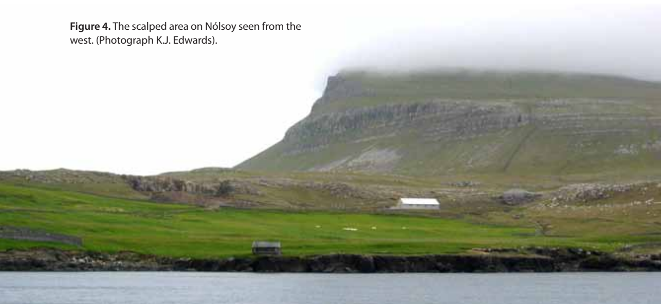
Figure 4. The scalped area on Nólsoy seen from the west.